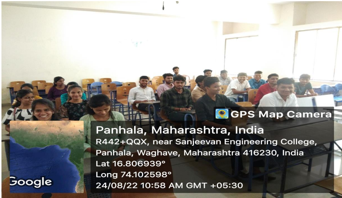
1. Students attending Seminar on Research Methodology