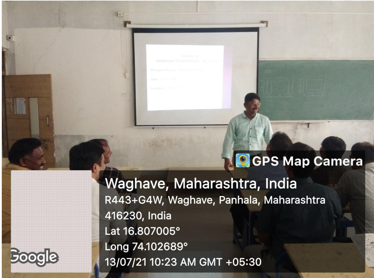
Snap of Workshop on Intellectual property rights