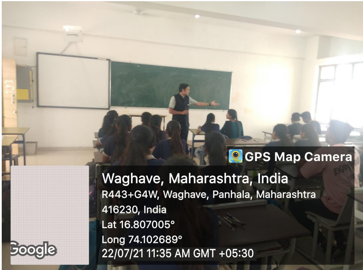
Snap of Seminar on Enforcement of IPR